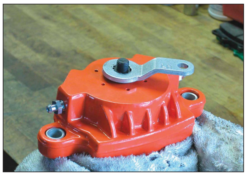
Photo 4: The parking brake lever can now be removed from the stud. Rocking the lever up and down will help free the lever from the stud.