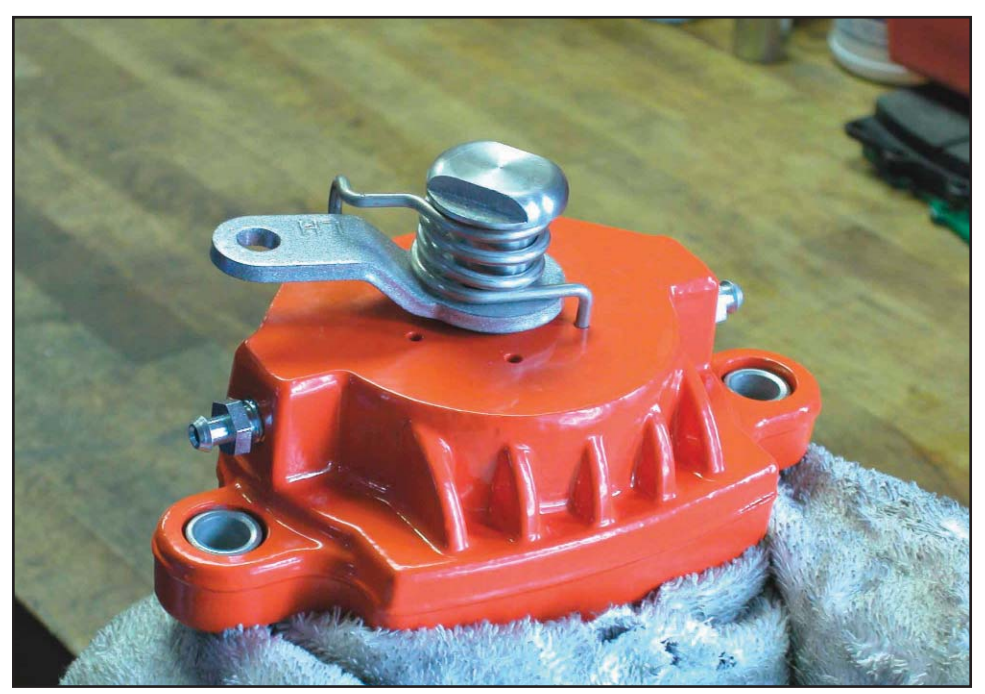
Photo 6: Reinstall the spring and retaining nut. Be sure to install the straight end of the spring into a hole in the back of the caliper; this will create spring tension as soon as the lever is moved.