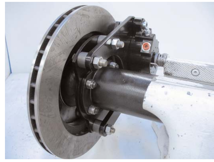
Rear view of the completed assembly.