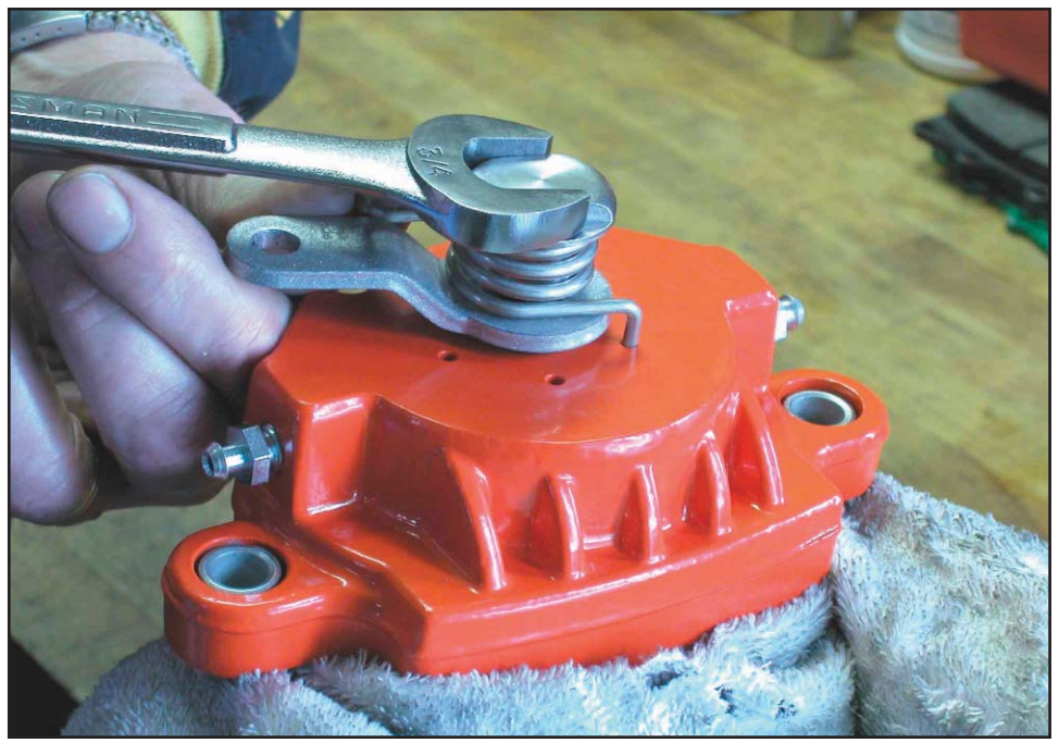
Photo 7: Tighten the retaining nut with a 3/4" open end wrench while holding the parking brake lever.