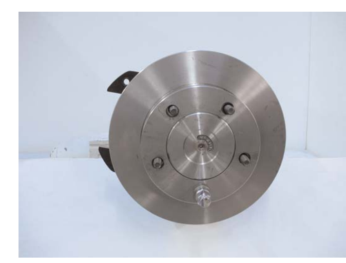
Slide a rotor on the axle and temporarily secure with at least one lug nut.

Install the caliper bracket on the four 7/16" bolts. Secure with the supplied nuts and torque to 75 ft/lbs.