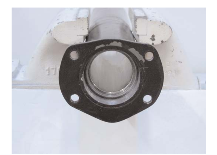
View of axle housing with the axle and brakes removed.