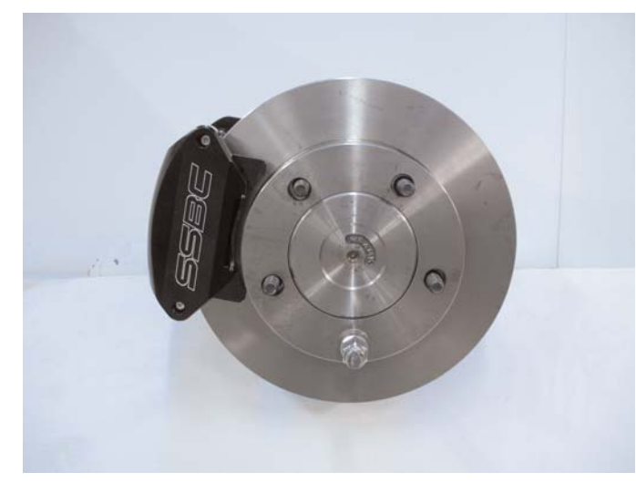
Slide the caliper over the rotor and secure with the provided slider bolts. Torque to 50 ft/lbs.