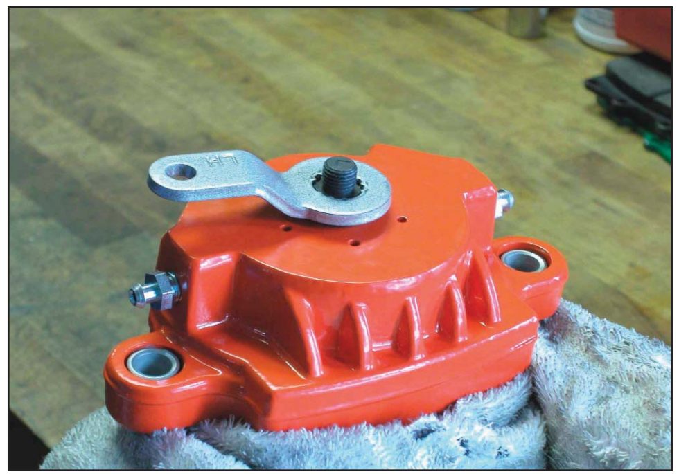
Photo 5: Install the lever in the new position, making sure the notches in the lever align with the hex shoulder of the stud. This insures the lever will turn the stud and not simply spin without engaging the parking brake.