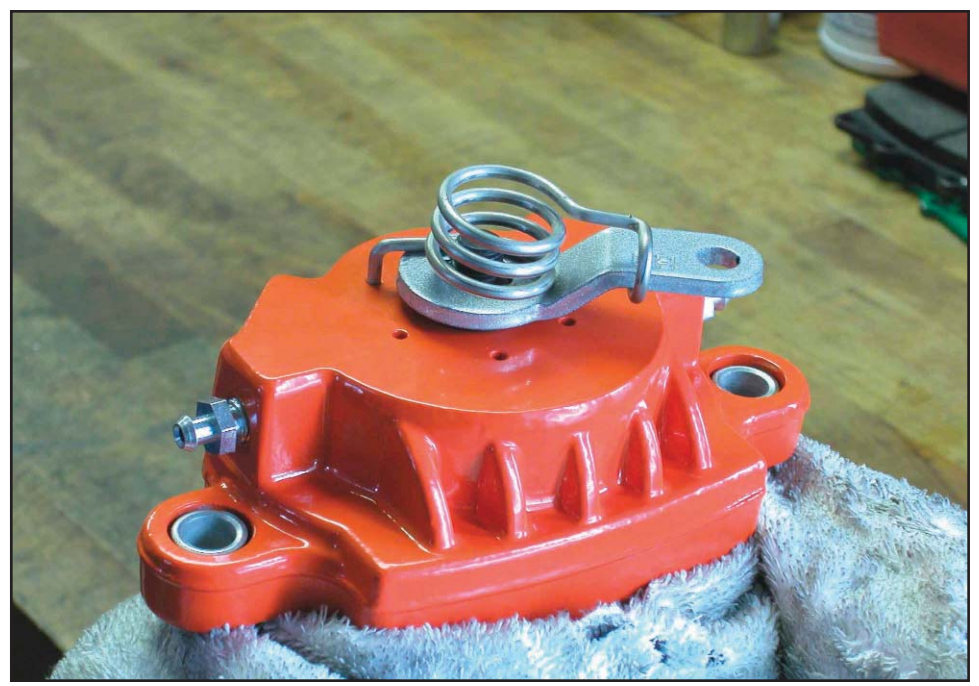
Photo 3: With the retaining nut removed, the parking brake return spring can be removed. Notice how the spring fits with the loop hooked onto the parking lever and the straight end pushed into the hole on the back of the caliper.