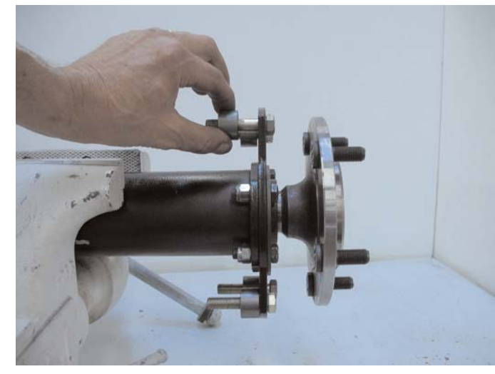
Slide one of the supplied tube spacers over each one of the 7/16" bolts.

Insall the supplied 7/16" bolts in the bracket. Slide the axle back in the housing and secure with the supplied 3/8" bolts and nylon lock nuts. Torque to 50 ft/lbs. Be sure to check the axle end play as per the instructions supplied with the axles.