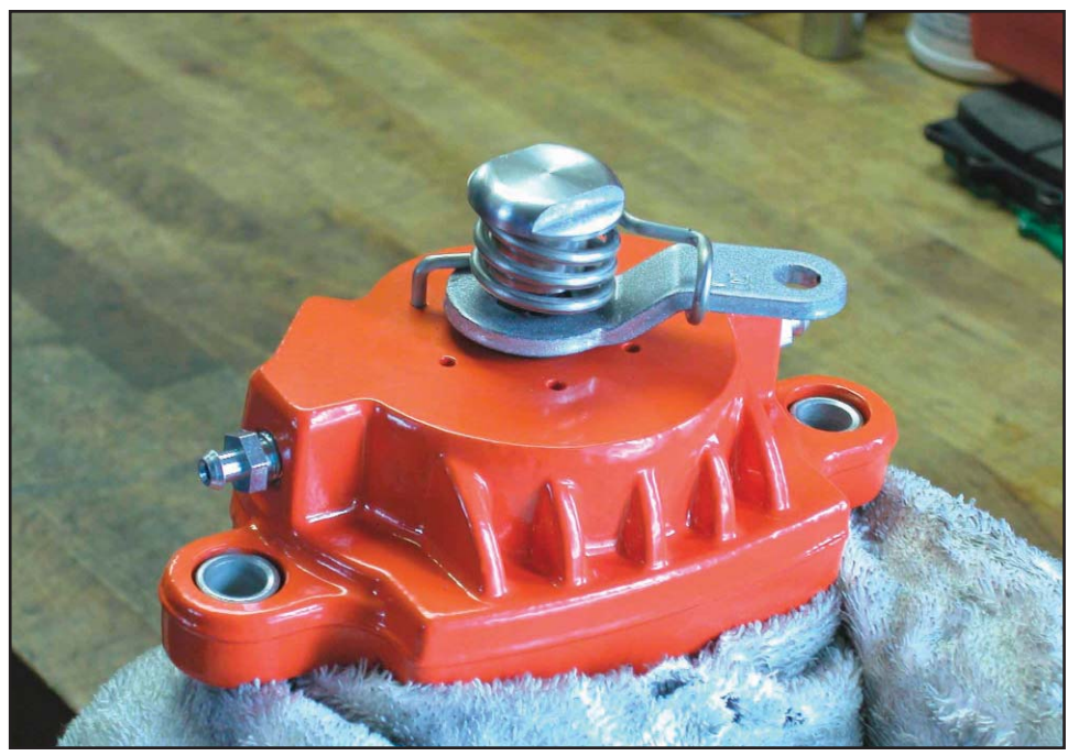
Photo 1: For some applications, it may be necessary to change the position of the parking brake lever to allow connection of the brake cables.