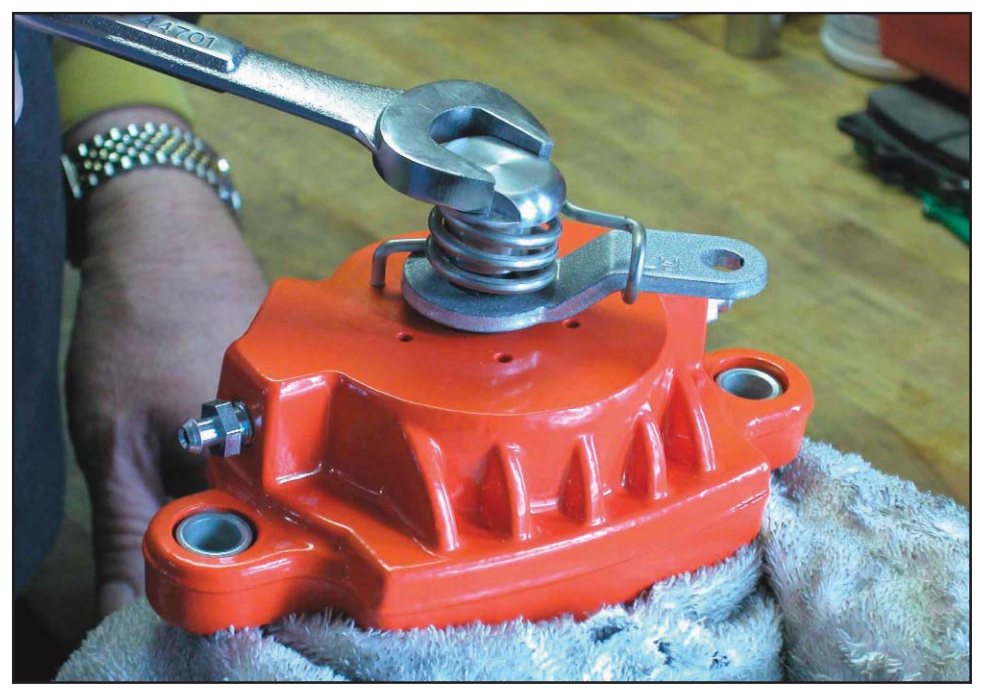
Photo 2: Using a 3/4" open end wrench, loosen and remove the retaining nut.