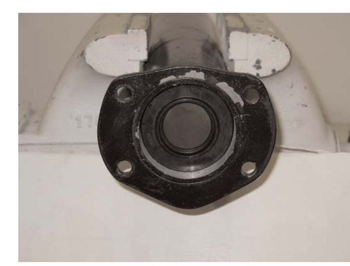
Install the bearing seal supplied with your new axles in the axle housing.