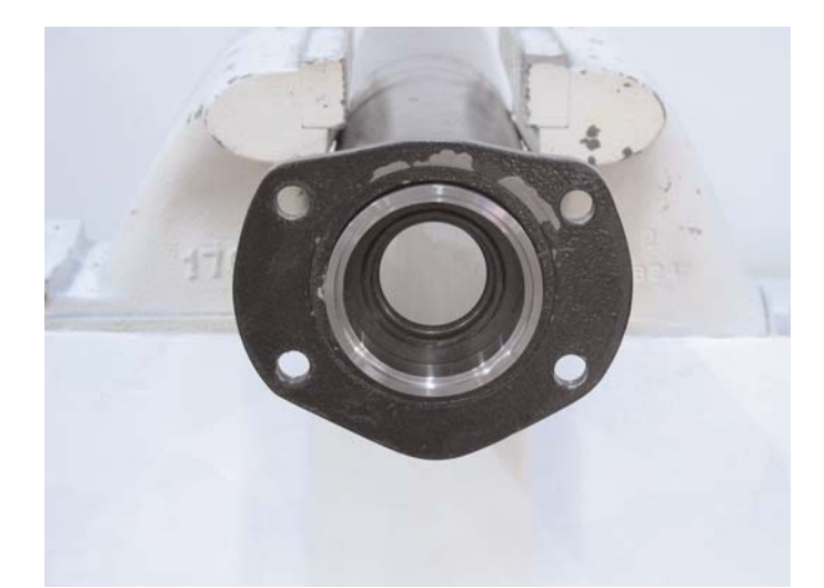
Install the spacer ring supplied with your new axles into the axle housing.