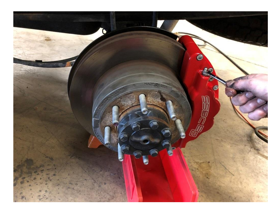
Photo 6: Bleeding the system, make sure to bleed both bleeders starting with the outside bleeder, as shown in the picture below.