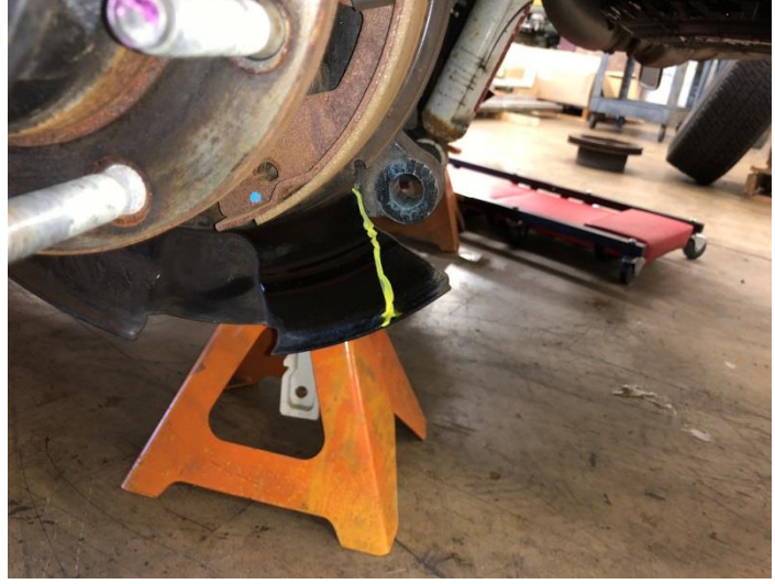
Photo 5: Use the proper safey equipment when cutting backing plate (safety glasses as well work gloves)