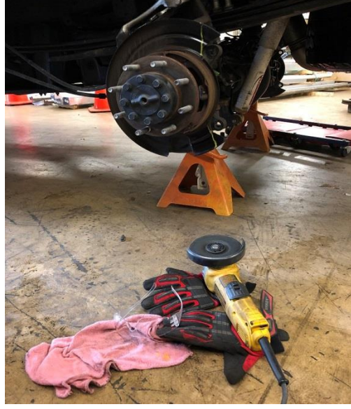
Barbarian B8 A404-21 Rev 2

Photo 5: Use the proper safey equipment when cutting backing plate (safety glasses as well work gloves)